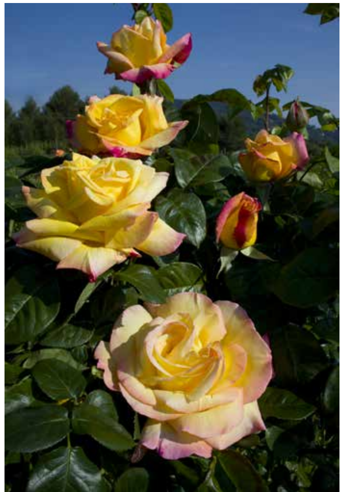
Rose 'Peace' - Meiland

■ THE SHOPPING CENTERS, Galeries Lafayette, Part-Dieu and Confluence will also be associated to the event and will propose animations to do with the rose.