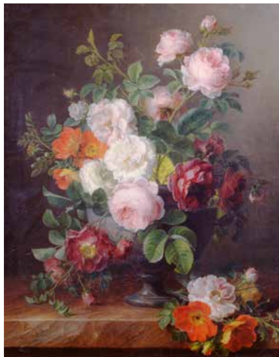
Vase de Roses, Cornelis Van Spaendonck 1855, Lyon Musée des Beaux-Arts

The "Exhibition of flowers" gathers paintings of some of the biggest masters of the flower at the end of the 18th century (Van Spaendonck, Van Dael,...) around Antoine Berjon (Fruits and flowers in a wicker basket), specialist from Lyon that created great wealth thanks to silk manufacturing.