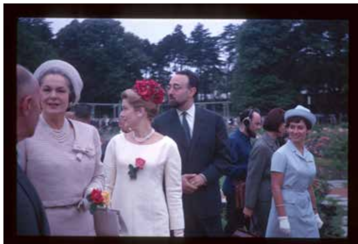
Inauguration of the International Rose Garden of Lyon - 1964

Olfactory visits and creative paths will also be delivered by the Beaux-Arts Museum. On May 30th and 31st, historical bouquets inspired by pieces of art from the museum will be presented.