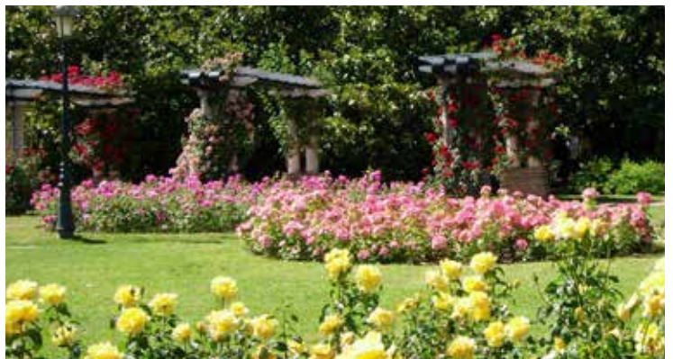
Big rose garden at the Tête d'Or Park

Today, still 50% of the European cultivators (the creators of new roses) come from Lyon and there are around 20,000 roses in the gardens and rose gardens in Lyon. These gardens are being used as a protection for older roses but also as an area of discovery for modern roses. This precious past will blossom into multiple forms during this 2015 spring in Lyon. This year, and for the first time in France, the city hosts this inescapable event for people passionate about roses. During 4 days, the world Convention of Rose Societies will bring together 600 convention delegates from the entire world from May 25th to June 1st.