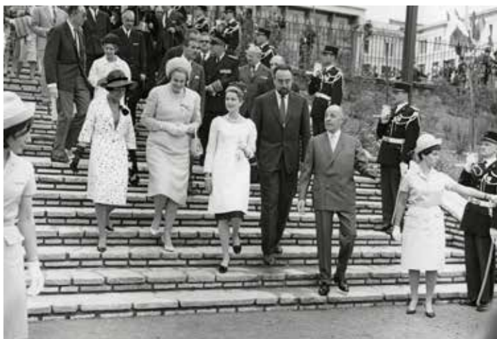
Inauguration de la Roseraie Internationale de Lyon - 1964

■ A musical evening the 18th June at 7:00 p.m