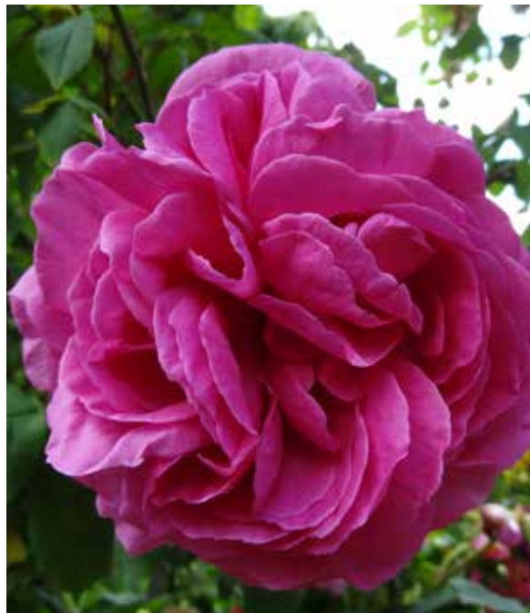
Rose 'Madame Isaac Pereire' - Bourbon

These rose creators are genuine artists who combine technical movements, patience, intuition and even genetic knowledge to select new original and exquisite varieties that will enrich our rose gardens of the 21st Century. Today, this excellent research is supported and relayed by the scientific studies driven by the laboratories in Lyon.