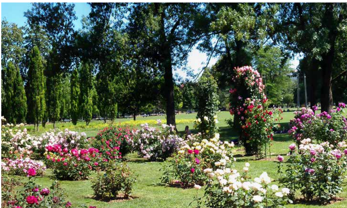
Big rose garden in the Tête d'Or Park

The culmination point of the festival will be on May 29th, 30th and 31st in the city center of Lyon in 3 emblematic places, and will also happen in the Tête d'Or Park with a weekend of animations dedicated to the rose.