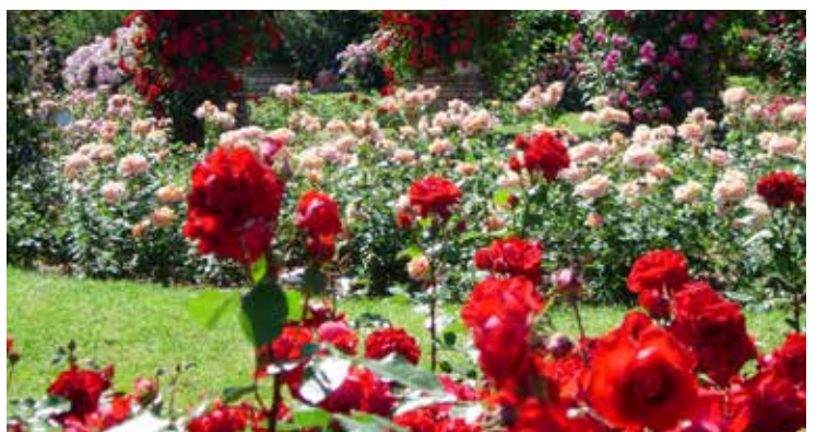
Big rose garden in the Tête d'Or Park