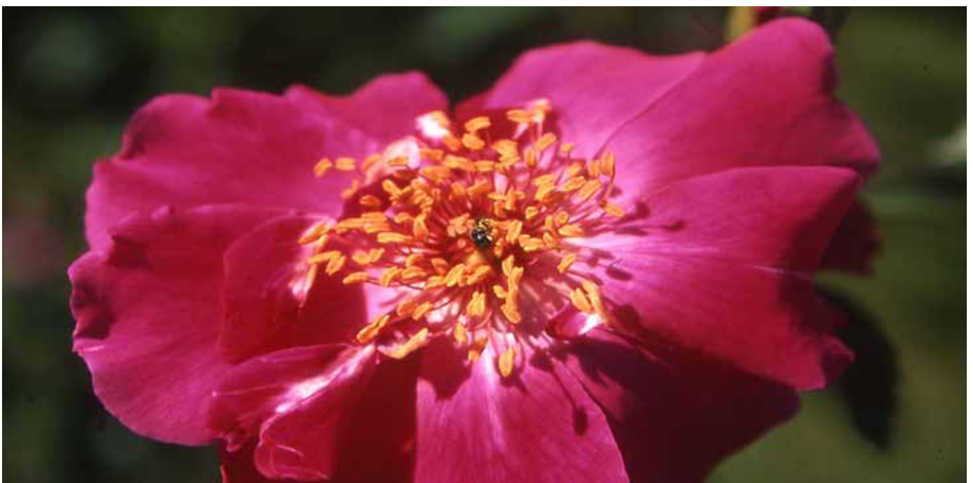
'Gloire des Rosomanes' - Plantier