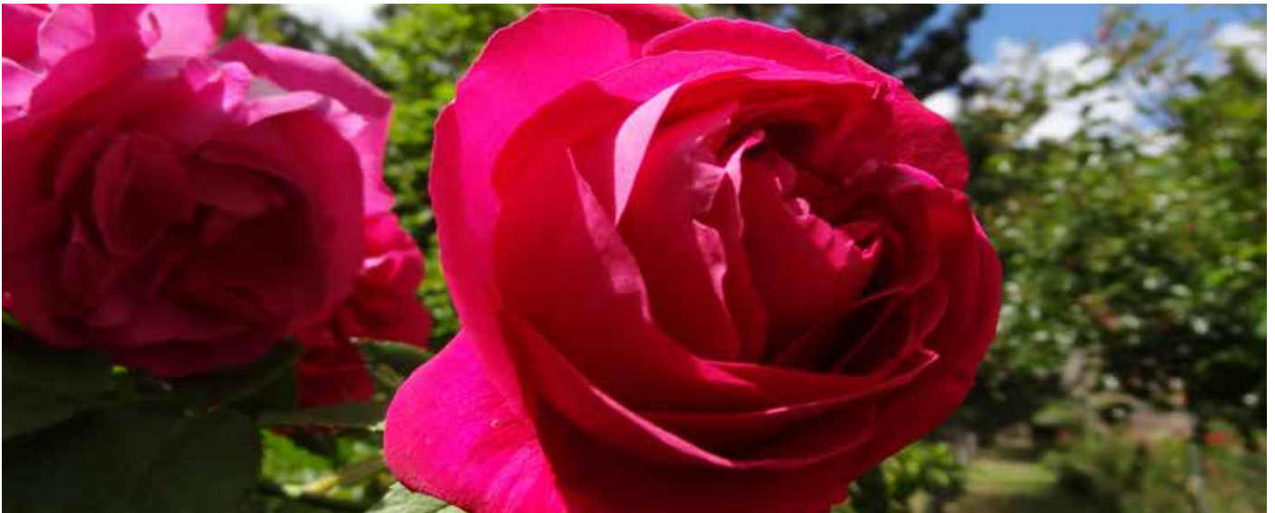
Rose 'Baron JB Gonella' - Bourbon

For producers and breeders, hosting a professional event in Lyon is a consecration. It is the acknowledgement of everything they have brought to the research and creation of roses for several generations. It will also be the occasion to prove their expertise and present their very last creations.