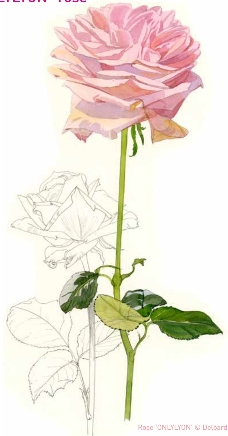
Rose 'ONLYLYON'

The naming ceremony of a new rose 'Belle de Gadagne' chosen by the public among 4 creations from Lyon will also be organized during the World Rose Festival.