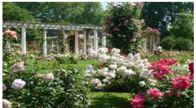
Contest Rose Garden