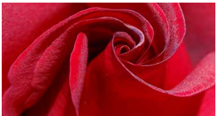
Black Magic - Tantau