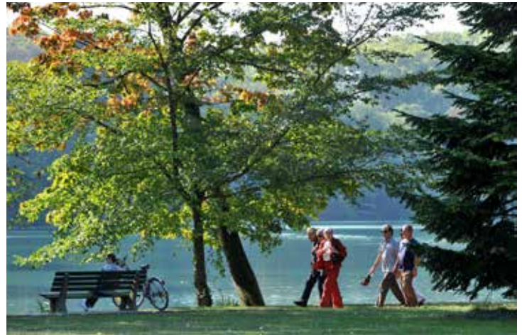
Tête d'Or Park

Throughout the whole city, plant pots are recomposed to play an anti-stress role. They adapt themselves to the atmosphere of the district but also to climate change problems. At the same time, Lyon has a very sustainable development approach.