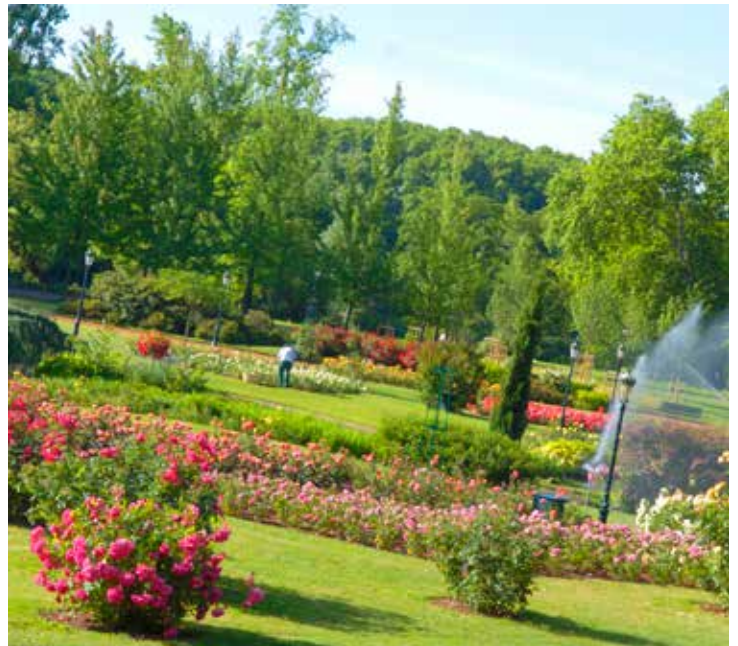
Big Rose Garden at the Tête d'Or Park

The genomic news of the rose, its results and perspectives will be in the heart of the discussions. Six conferences and two workshops will be organized for the 200 French and foreign participants, amongst which numerous researchers, agronomists and cultivators.