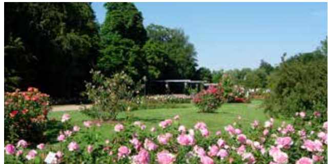
Big Rose Garden

The International Rose Contest will take place on Friday, May 29th 2015 and the French Society of Roses will designate the winners.