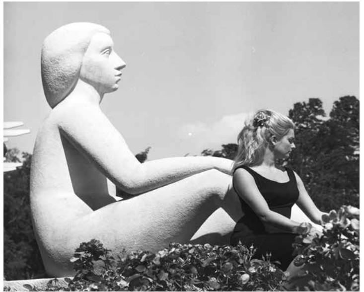
the rose garden is used as a setting for photo shoots

In 1849, JB Guillo son builds a graft that will revolutionize the cultivation of the rose. He builds the rose "La France", the first flower of the tea hybrid family to be marketed : (crossing between european and chinese varieties) : bright pink on the exterior and silver in the interior, it opens the path to the modern rose, coloured and surprising.