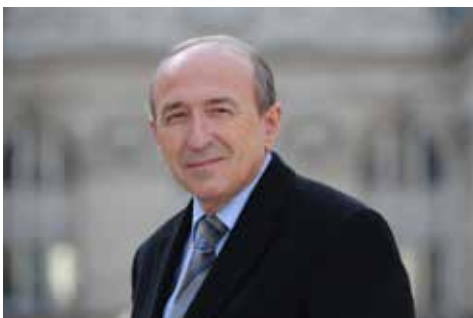
GÉRARD COLLOMB SENATOR-MAYOR OF LYON PRESIDENT OF THE MÉTROPOLE DE LYON

I very much hope to see you amongst us during the celebration in Lyon and wish you an enjoyable and memorable World Rose Festival !