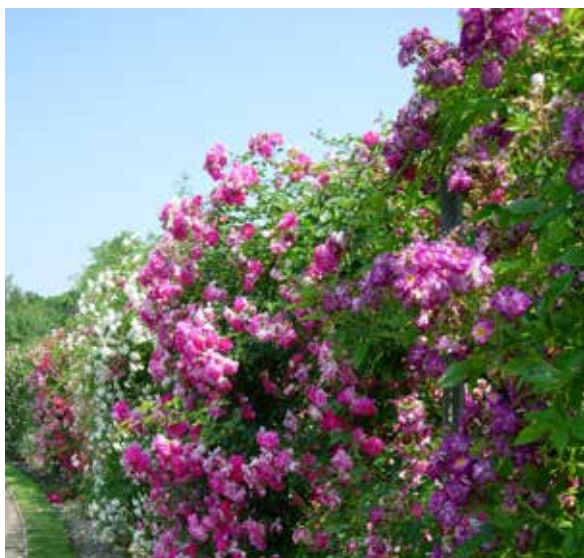
The botanical rose garden

This research is an economic challenge for the future of the rose in France because of other international laboratories in the USA, in Australia, in Japan, the Netherlands and Israel. Nevertheless, the 21st century rose will probably be more robust, more disease-resistant, more flowery and above all... more scented !